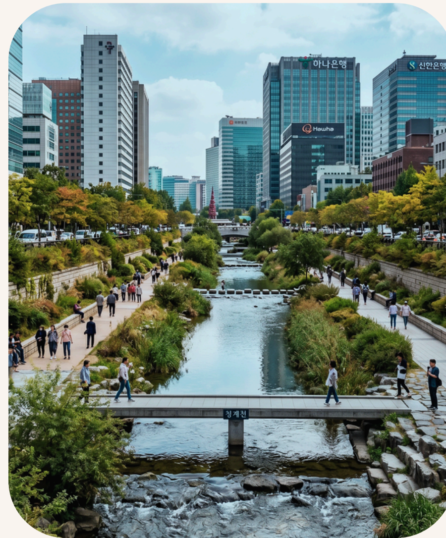
Cheonggyecheon Stream An Urban Oasis in the Heart of Seoul