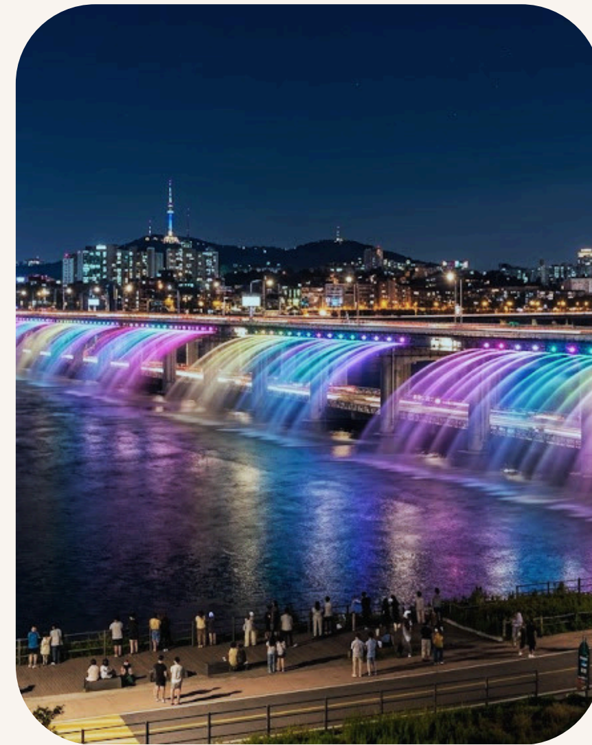
< Optional Tour > Seoul City Night Tour (Namsan & Han River) or Deoksugung Palace Night Tour (Experience the enchanting night view of the palace)