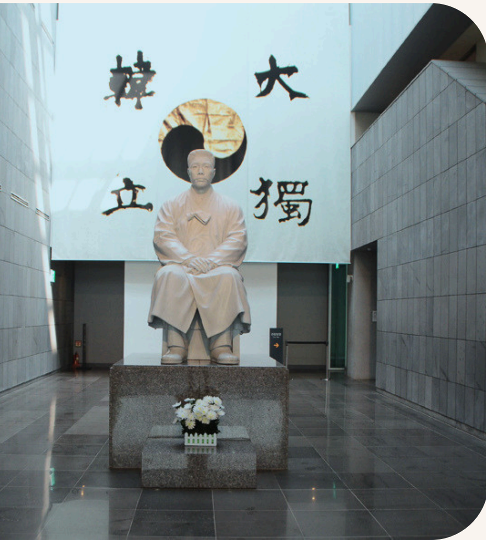
Ahn Jung-geun Memorial Hall Jung-geun Pattern