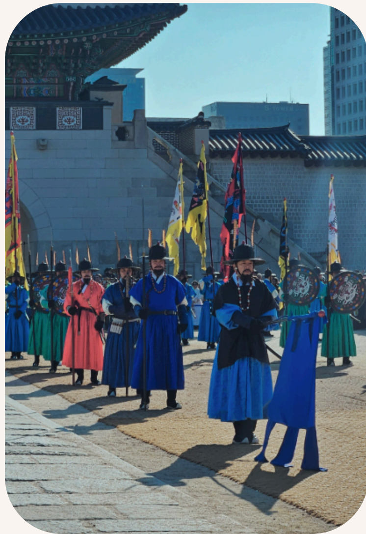
Gyeongbokgung Palace The Royal Guard Changing Ceremony