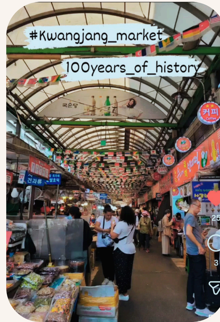
Traditional Gwangjang Market A Must-Visit Street Food Paradise